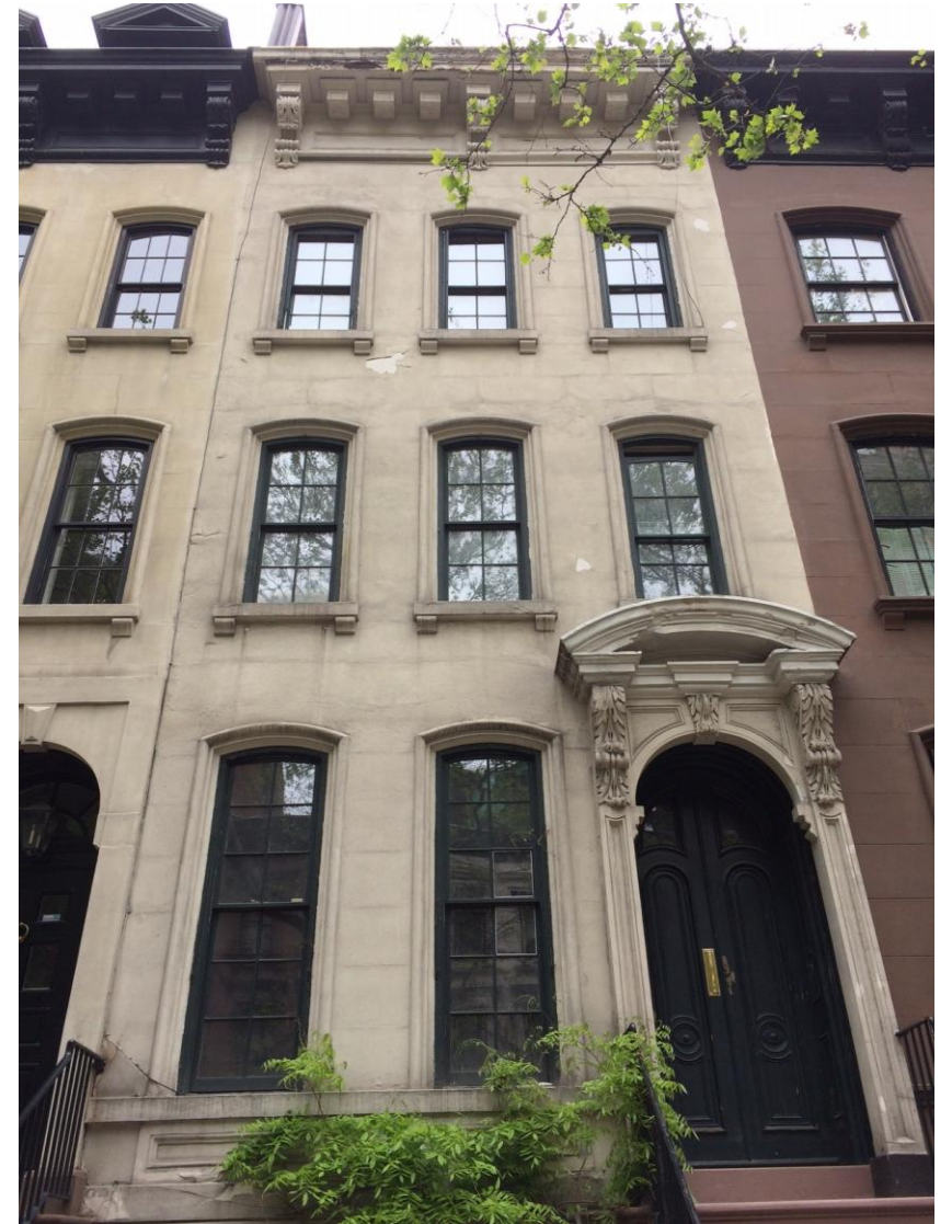
PRE CONSTRUCTION – SOUTH STREET FAÇADE