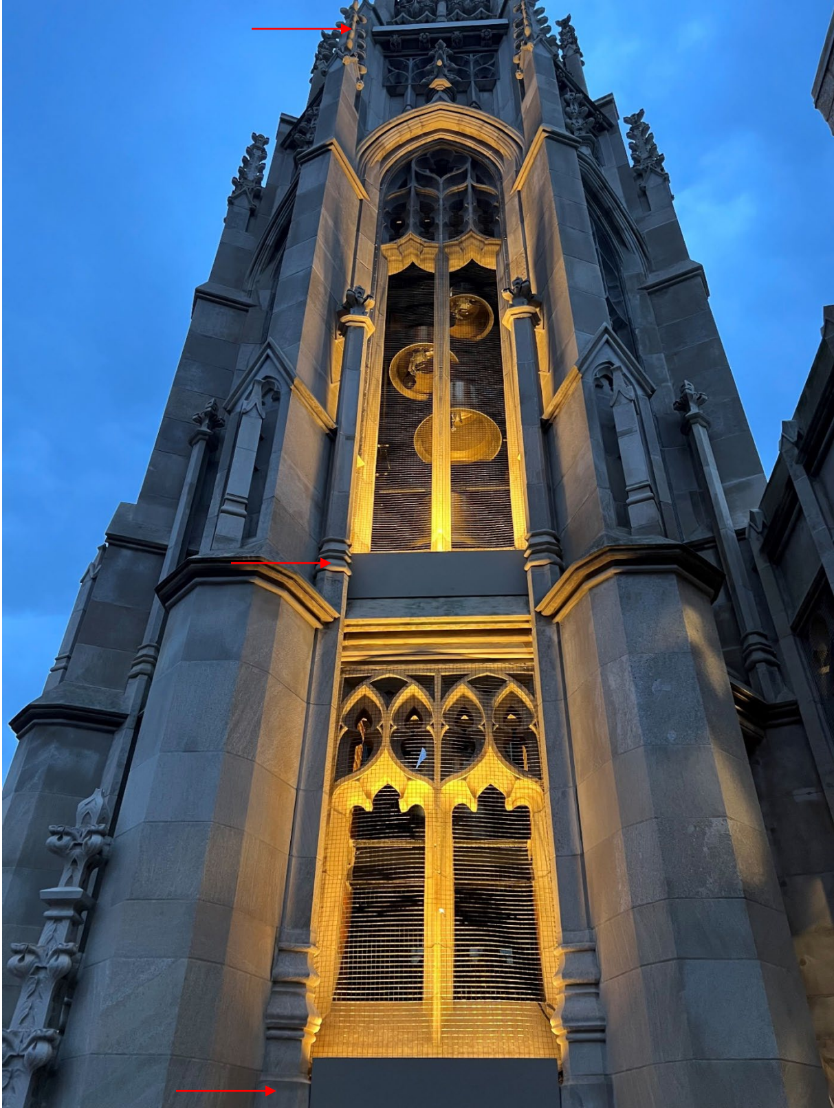
Image 2: Close-up view of belltower with temporary light fixture mock-up installed at south bay (red arrows), January 2023. Note that final installation with metal (instead of temp. plywood) fixture supports/glare shields would be visually reduced by about half.