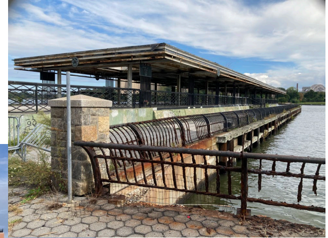
Existing Pier at 107 th St