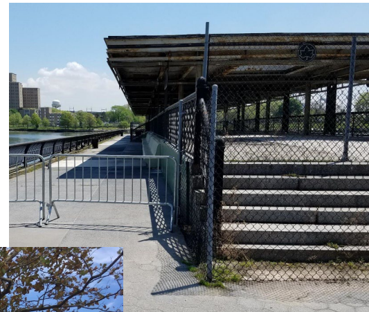
Existing Pier at 107 th St