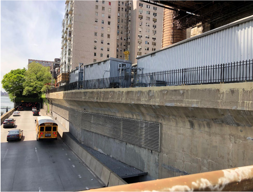
View from the top of 60th Street Ramp looking over the FDR toward 59th Street and the eastern boundary of the ConEd Facility