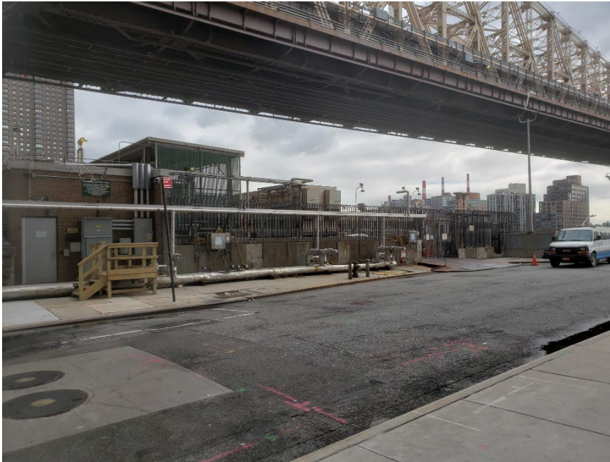
Looking north from E. 59th Street towards ConEd area