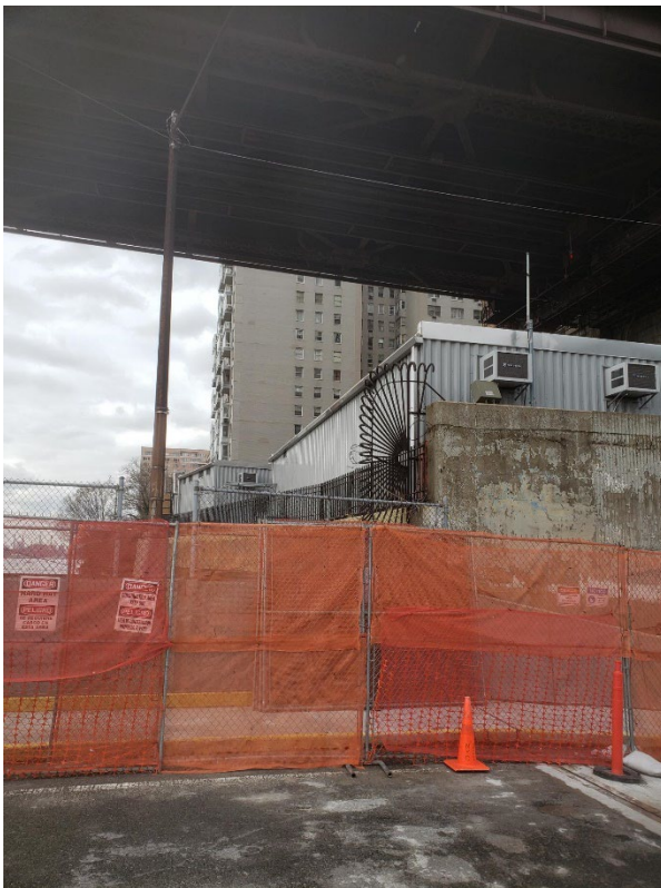
Looking south from ramp; FDR is below, beyond orange fence