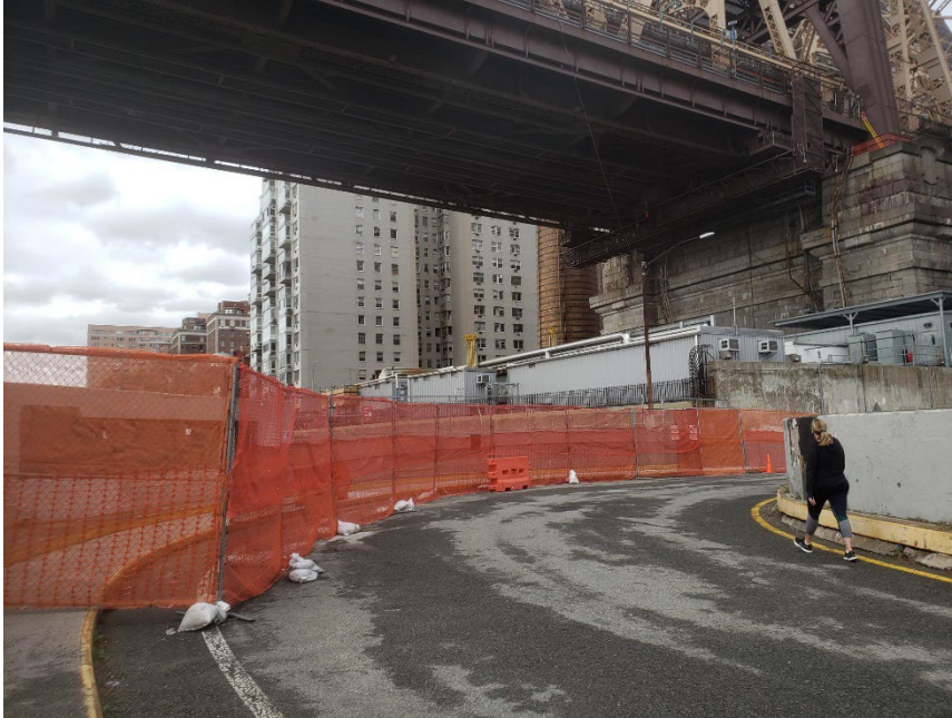
Looking south from 60th Street ramp towards Con Ed area