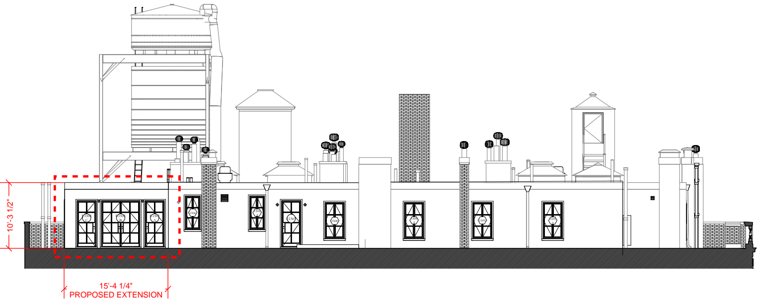
1 - PROPOSED SOUTH ELEVATION

PETER PENNOYER ARCHITECTS 136 Madison Avenue, 11th Floor, New York, New York 10016-6711