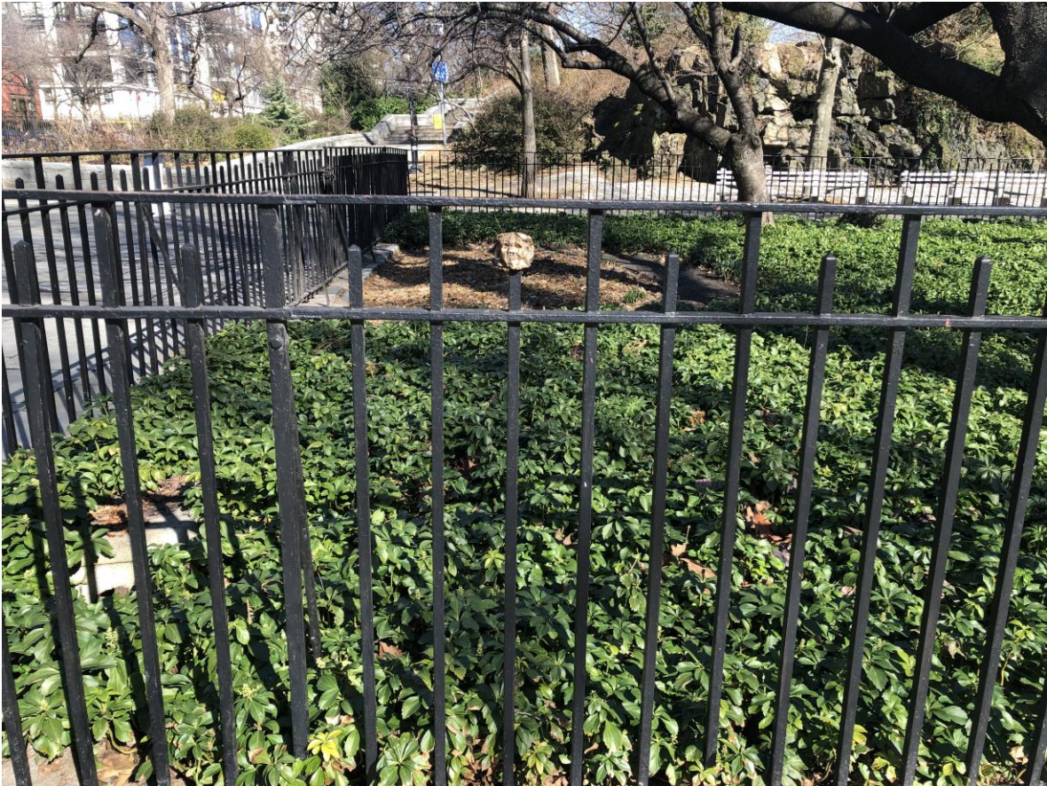
Sample artwork to show scale in relation to fence