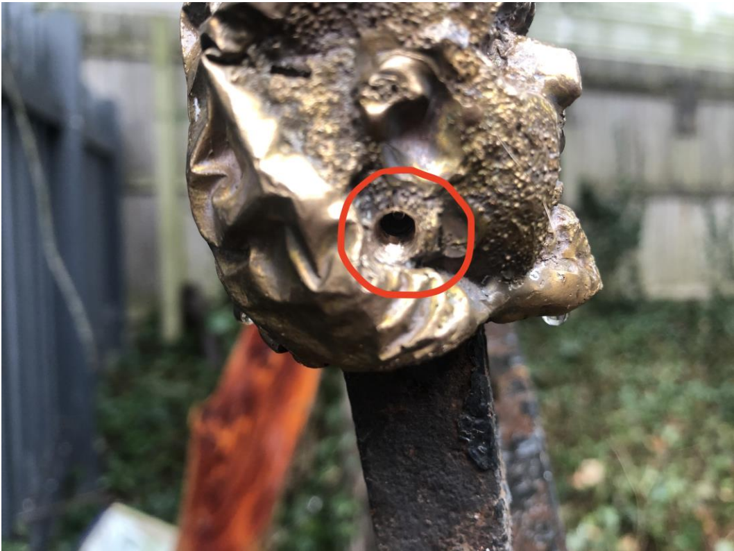
Photos showing locations of hidden screws