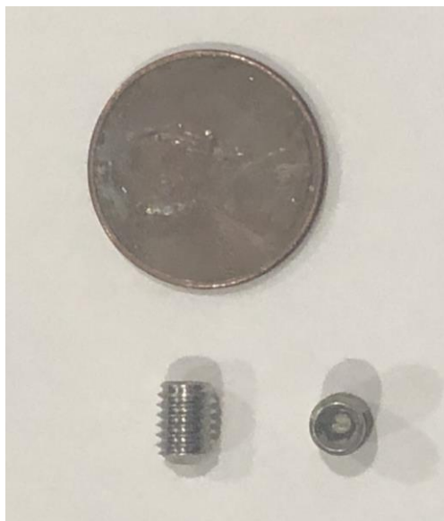
Sample of screws