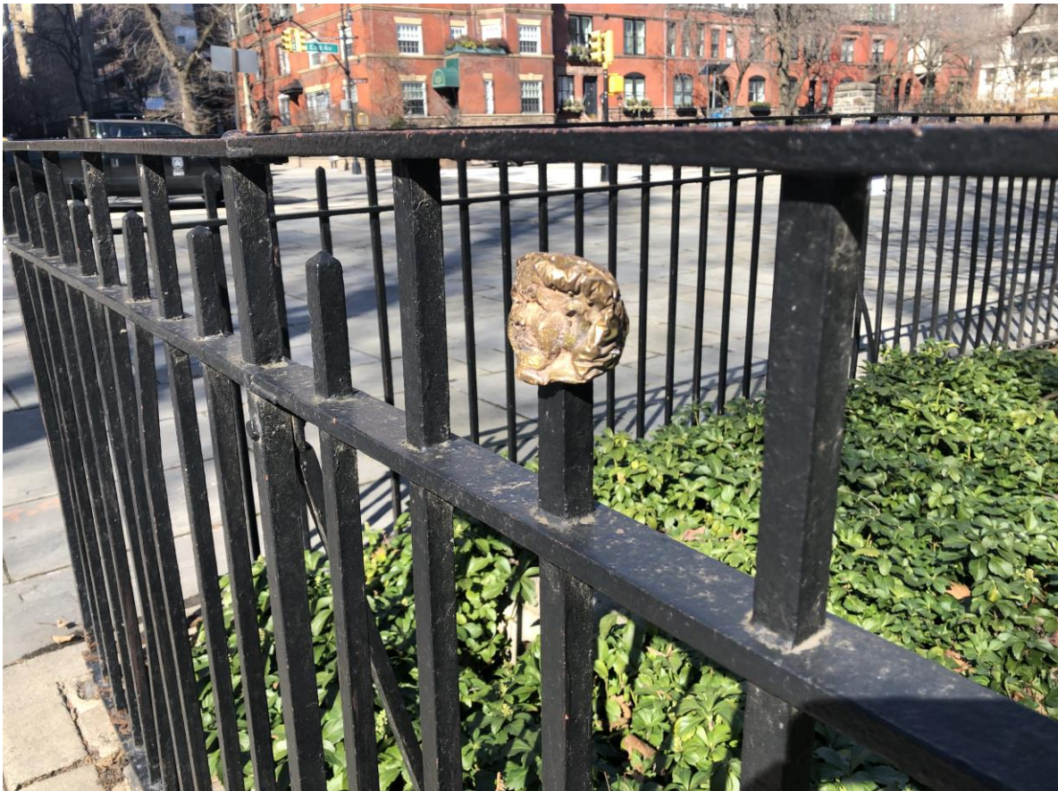
Sample artwork to show placement on fence post

Artworks are carved out of apples, which shrink over time and are then cast in brass.