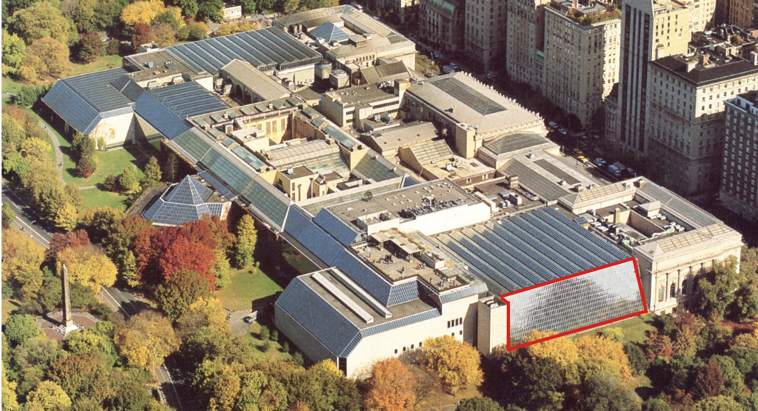
ROCKEFELLER WING SLOPED GLAZING REPLACEMENT