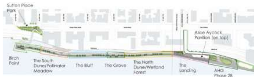
EMG and Andrew Haswell Green Park