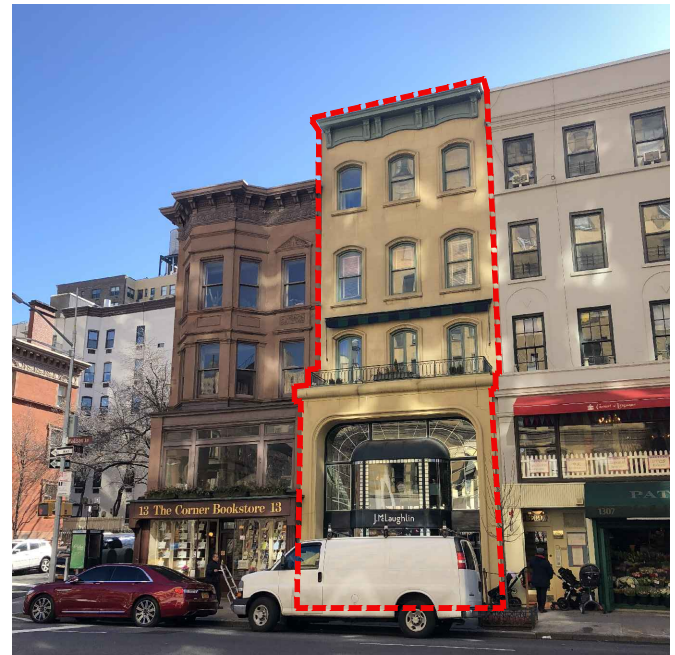
3 PHOTO OF EXISTING BUILDING FACADE SCALE: N.T.S.

NOTE: THIS APPLICATION IS ONLY FOR PAINTING THE UPPER BUILDING FACADE WALLS ONLY. PAINTING EXISTING WINDOW FRAMES AND CORNICE AND NEW STOREFRONT SCOPE IS UNDER SEPARATE APPLICATION STAFF REVIEW BY LANDMARKS PRESERVATION COMMISSION, DOCKET #LPC-19-38761.