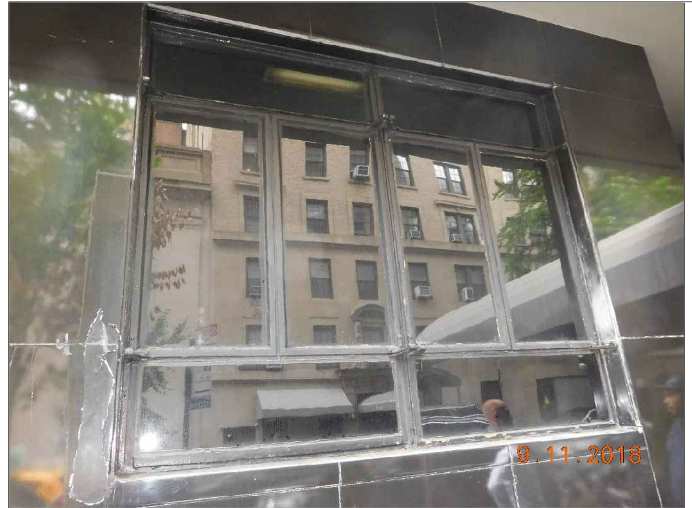
PHOTO OF EXISTING WINDOW TO BE REMOVED