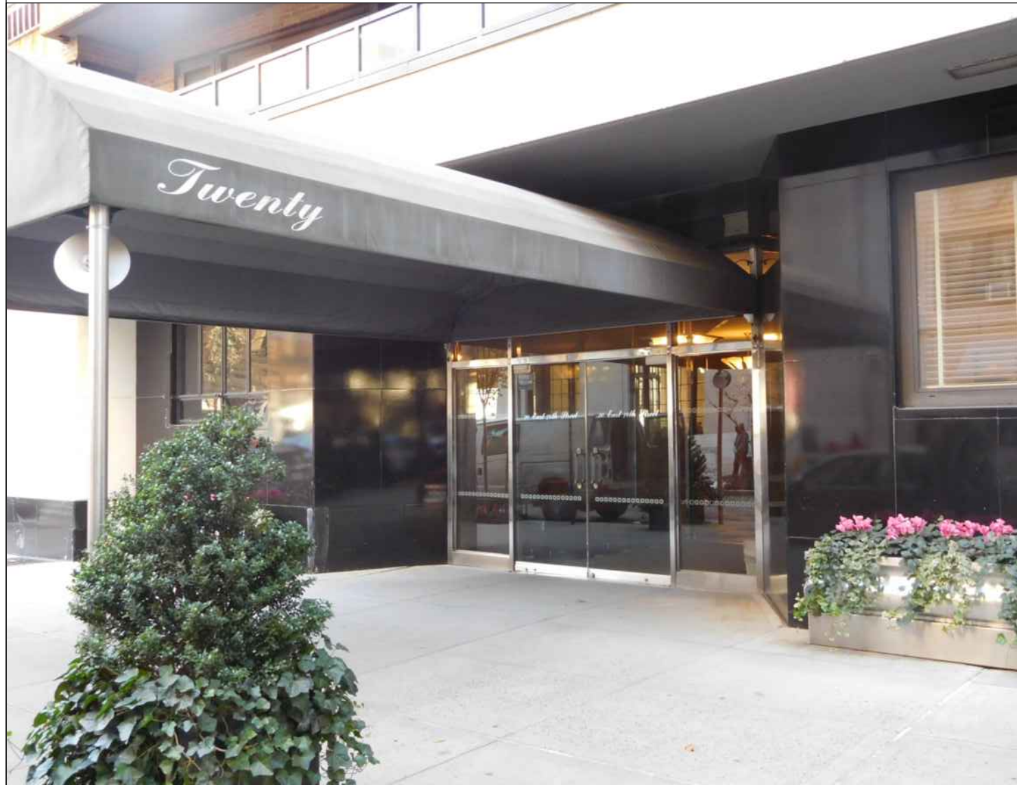
PHOTO OF EXISTING BUILDING STONE CLADDING