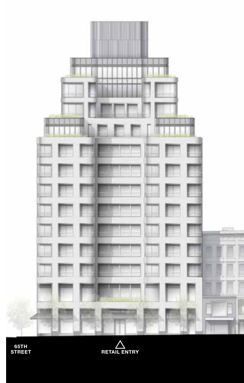
BUILDING ELEVATION - MADISON AVENUE

MECH SCREEN ±189'-0" ROOF ±178'-0" MECHANICAL ±166'-0" MECHANICAL ±154'-0" 12 TH FLOOR ±142'-0" 11 TH FLOOR ±130'-0" 10 TH FLOOR ±118'-0" 9 TH FLOOR ±106'-0" 8 TH FLOOR ±94'-0" 7 TH FLOOR ±82'-0" 6 TH FLOOR ±70'-0" 5 TH FLOOR ±58'-0" 4 TH FLOOR ±46'-0" 3 TH FLOOR ±34'-0" 2 TH FLOOR ±19'-6" 1 ST FLOOR ±0'-0"