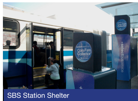
SBS Station Shelter