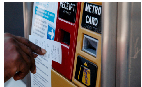
Off-board fare collection machine