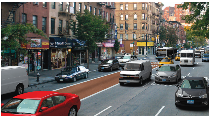
Image of an offset bus lane. Planned for First Ave from 79th to 125th St.