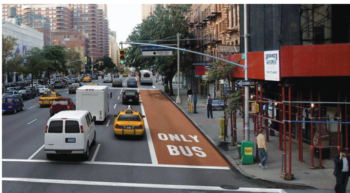
Image of a curbside bus lane. Planned for First Ave from 72nd St to 79th St.