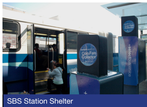
SBS Station Shelter