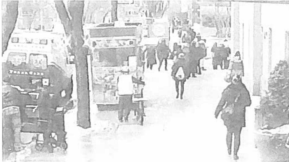
11-YORK AVE ENTRANCE OUTSIDE PTZ # 1

Operator : msk Station : 1275D2REPORT Capture Time : 3/4/2015 4:57 PM Note :