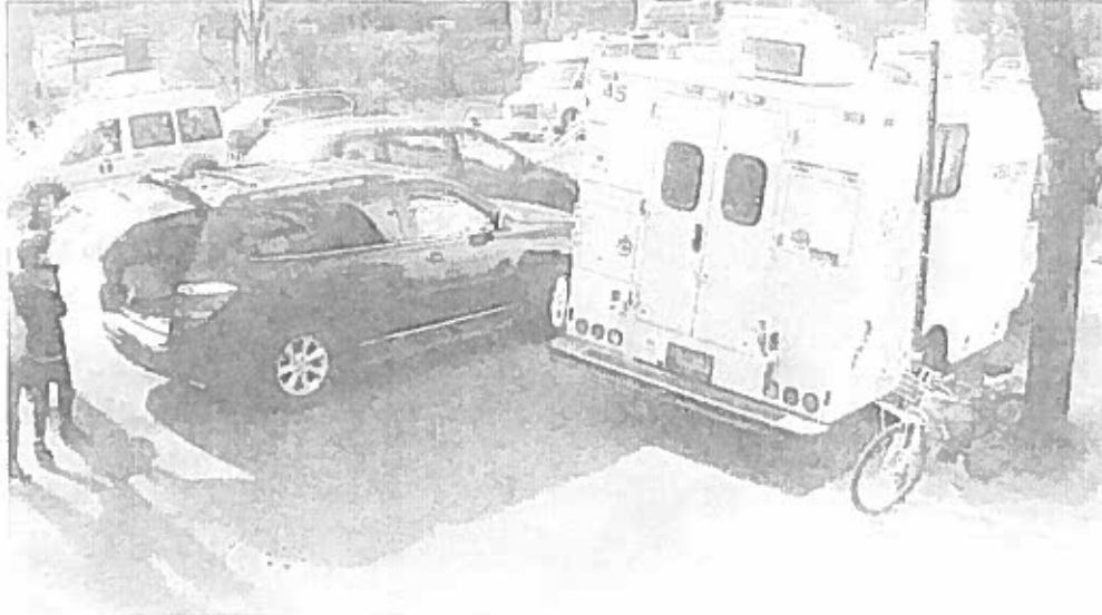
M-YORK AVE ENTRANCE OUTSIDE PTZ # 1

Operator : msk Station : 1275D2REPORT Capture Time : 4/2/2015 10:01 AM Note :