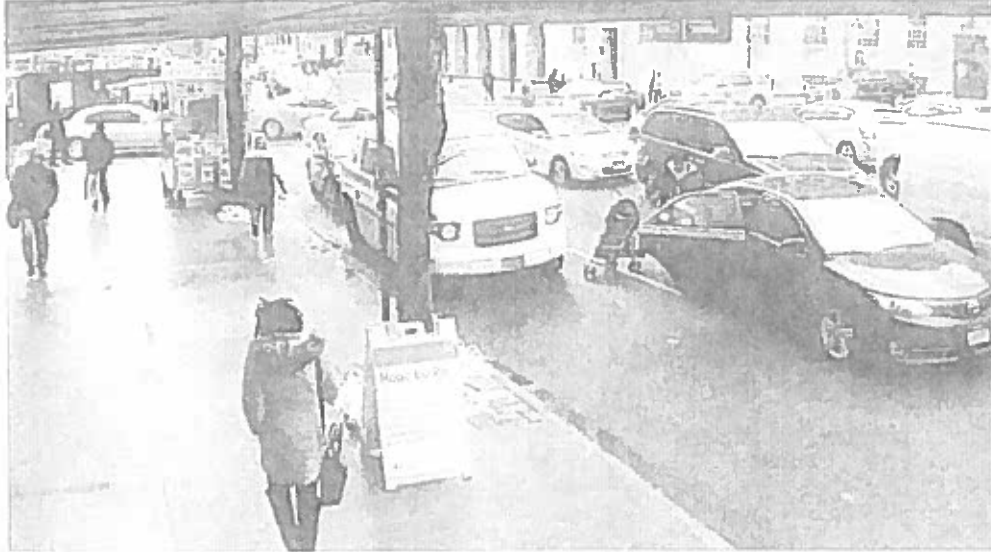
M-YORK AVE ENTRANCE OUTSIDE PTZ # 1

Operator : msk Station : 1275D2REPORT Capture Time : 3/4/2015 11:11 AM Note :