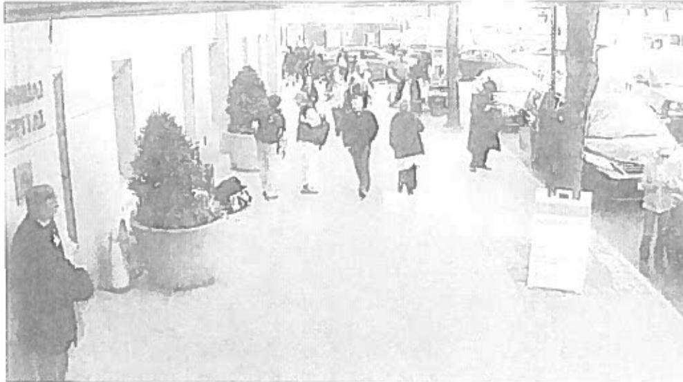
M-YORK AVE ENTRANCE OUTSIDE PTZ # 1

Operator : msk Station : 1275D2REPORT Capture Time : 4/2/2015 3:58 PM Note :