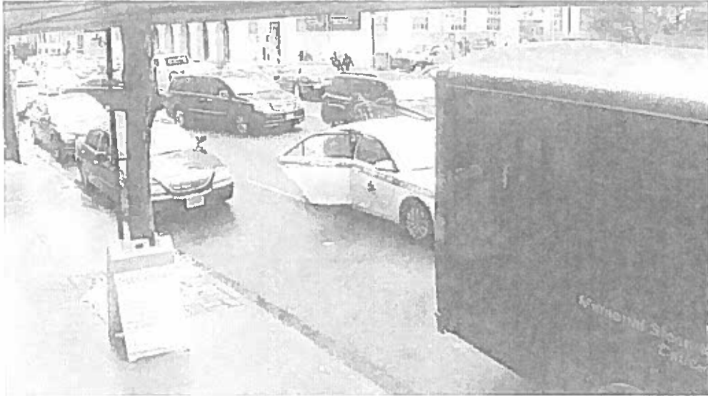
M-YORK AVE ENTRANCE OUTSIDE PTZ # 1

Operator : msk Station : 1275D2REPORT Capture Time : 3/4/2015 11:36 AM Note :