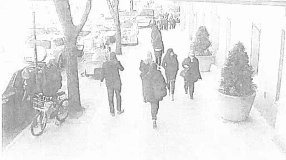
M YORK AVE ENTRANCE OUTSIDE PTZ # 1

Operator : msk Station : 1275D2REPORT Capture Time : 4/2/2015 2:58 PM Note :