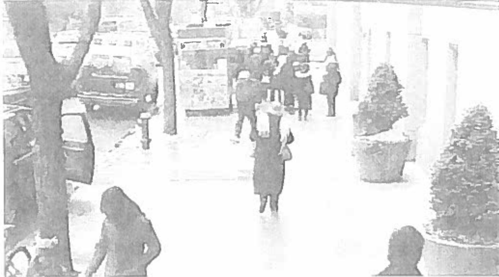
M-YORK AVE ENTRANCE OUTSIDE PTZ # 1

Operator : msk Station : 1275D2REPORT Capture Time : 3/4/2015 4:42 PM Note :