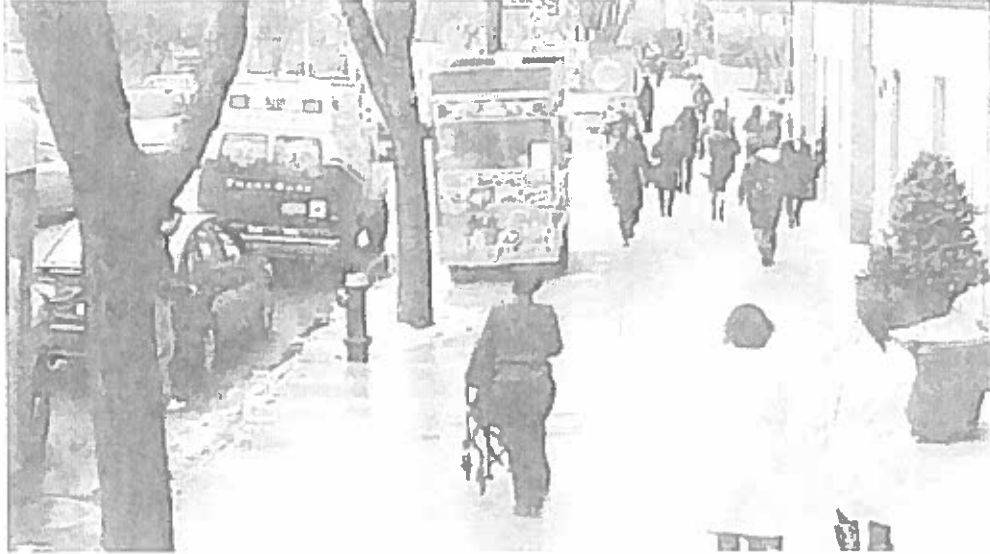
M-YORK AVE ENTRANCE OUTSIDE PTZ # 1

Operator : nisk Station : 1275D2REPORT Capture Time : 3/4/2015 4:56 PM Note :