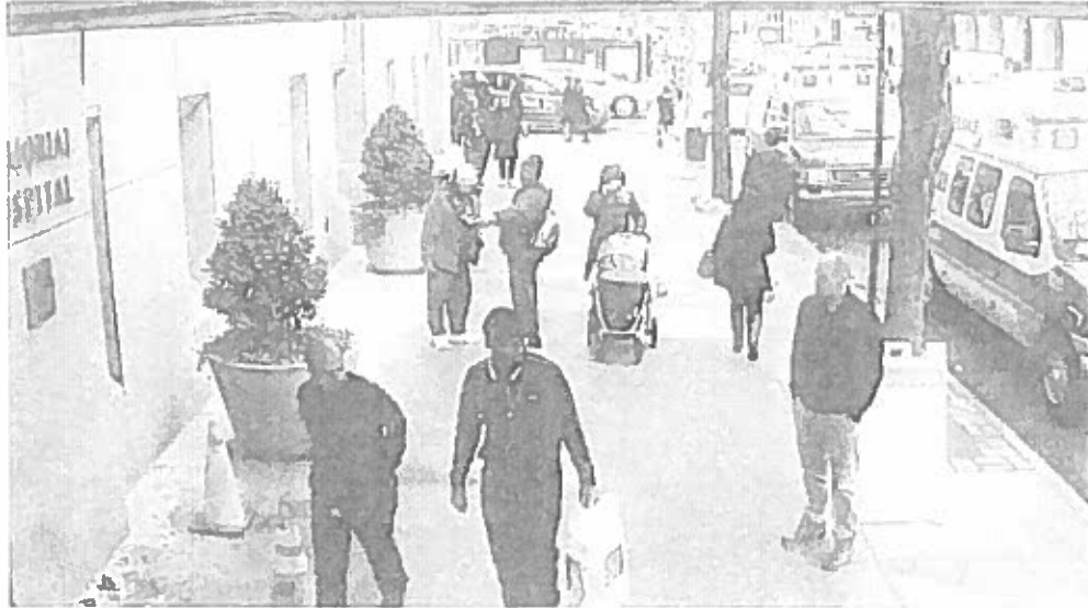
M-YORK AVE ENTRANCE OUTSIDE PTZ # 1

Operator : msk Station : 1275D2REPORT Capture Time : 3/4/2015 4:35 PM Note :