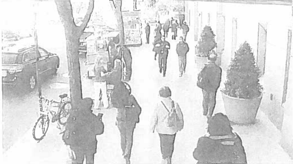
M YORK AVE ENTRANCE OUTSIDE PTZ # 1

Operator : msk Station : 1275D2REPORT Capture Time : 4/2/2015 3:10 PM Note :