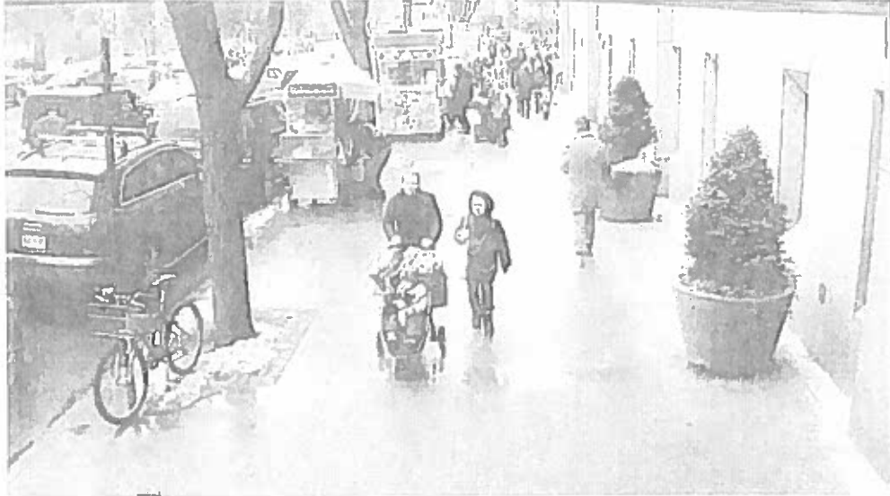
M-YORK AVE ENTRANCE OUTSIDE PTZ # 1

Operator : msk Station : 1275D2REPORT Capture Time : 3/4/2015 2:55 PM Note :