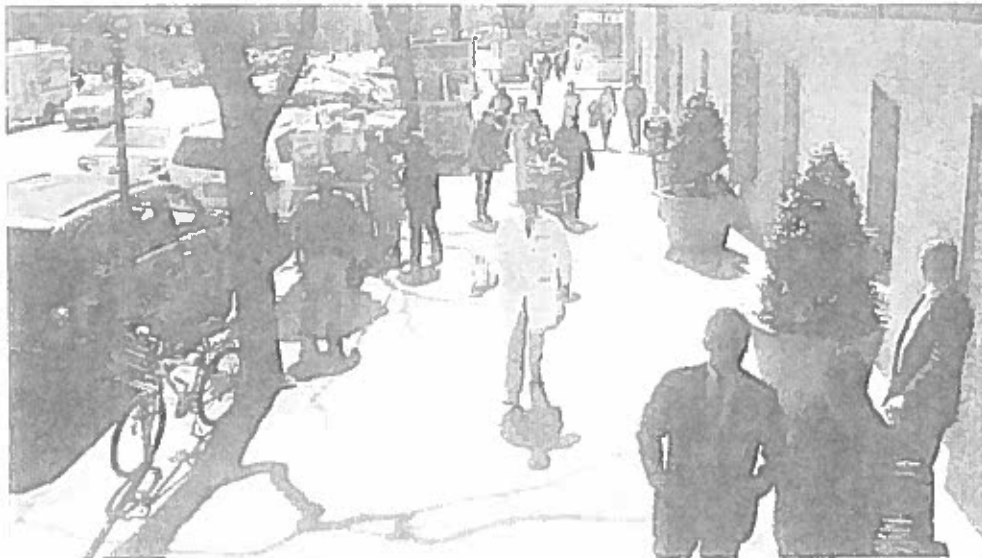
M-YORK AVE ENTRANCE OUTSIDE PTZ # 1

Operator : msk Station : 1275D2REPORT Capture Time : 4/2/2015 1:58 PM Note :