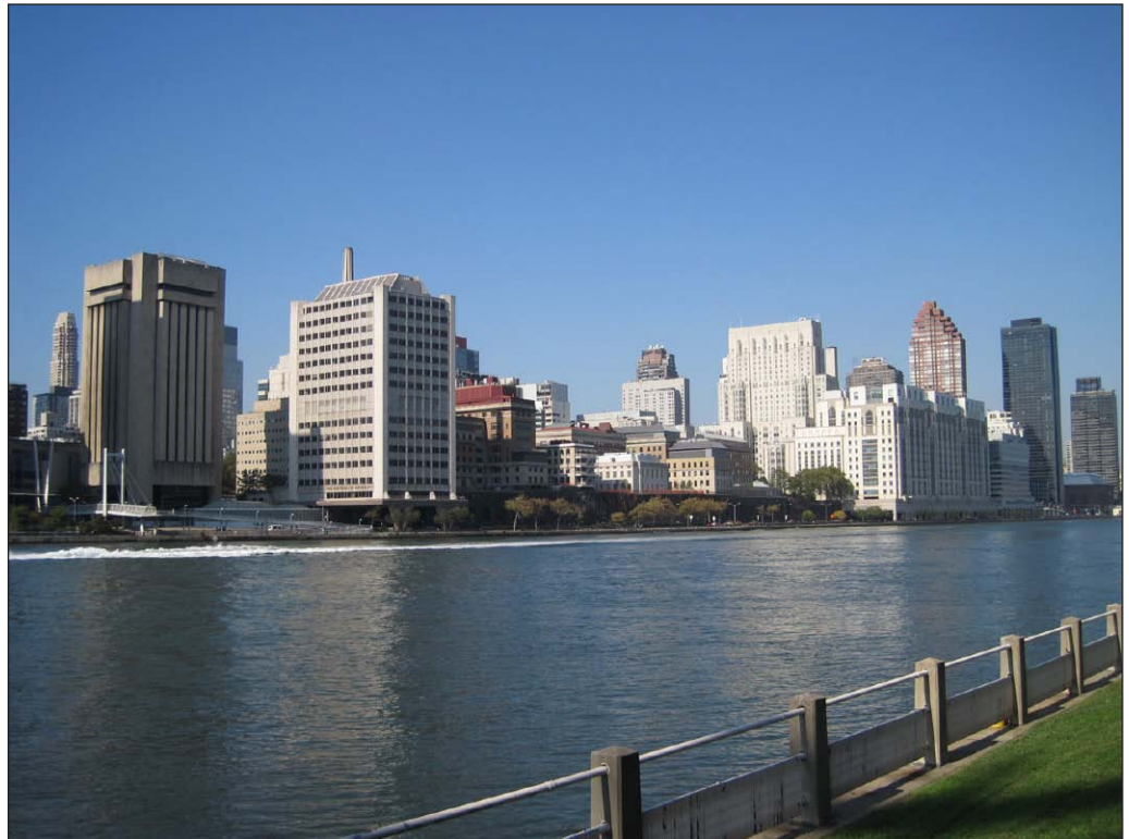
View Rockefeller University from Roosevelt Island 3