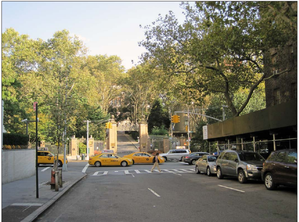
View east on East 66th Street to Rockefeller University Campus 2