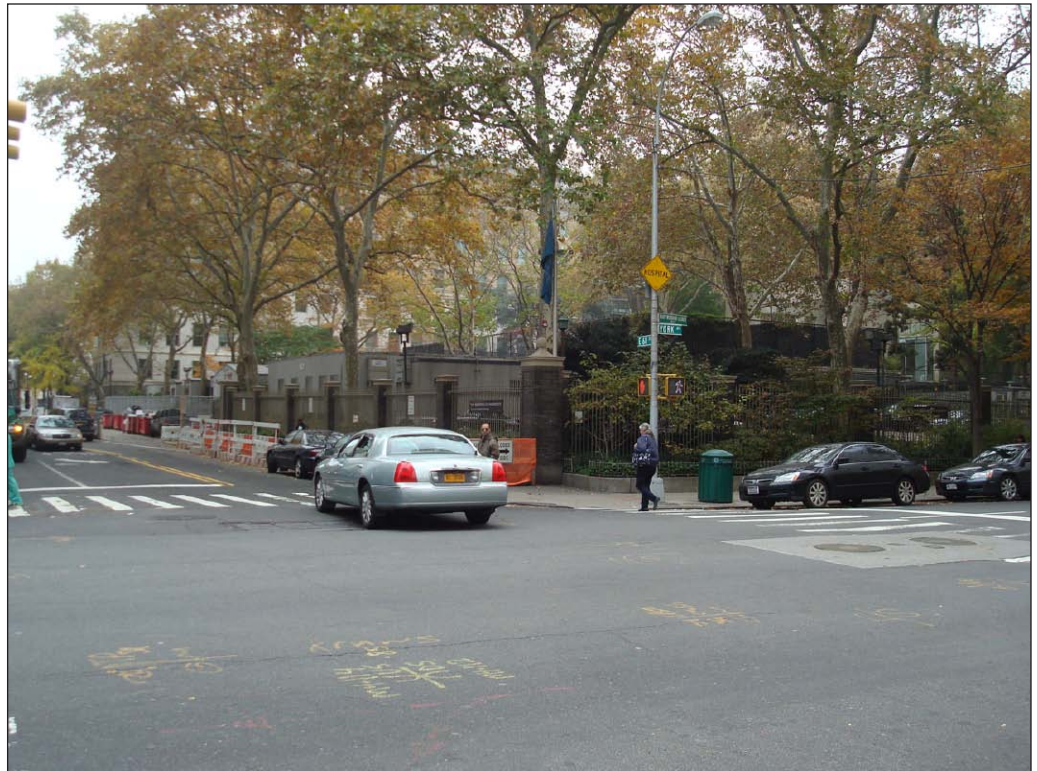
Existing/ No-Action Condition