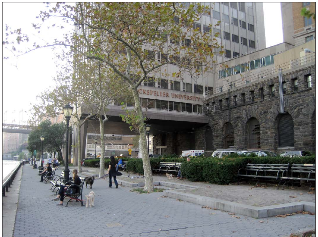
View south on East River Esplanade of Rockefeller Research Building 6