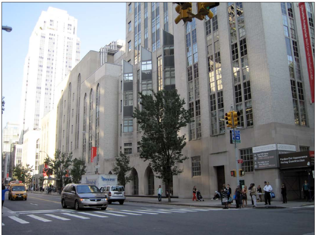
View northeast of NYPH-Weill Medical College from York Avenue at East 68th Street 8