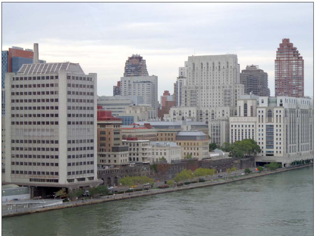
View of Rockefeller University from Roosevelt Island Tram 10