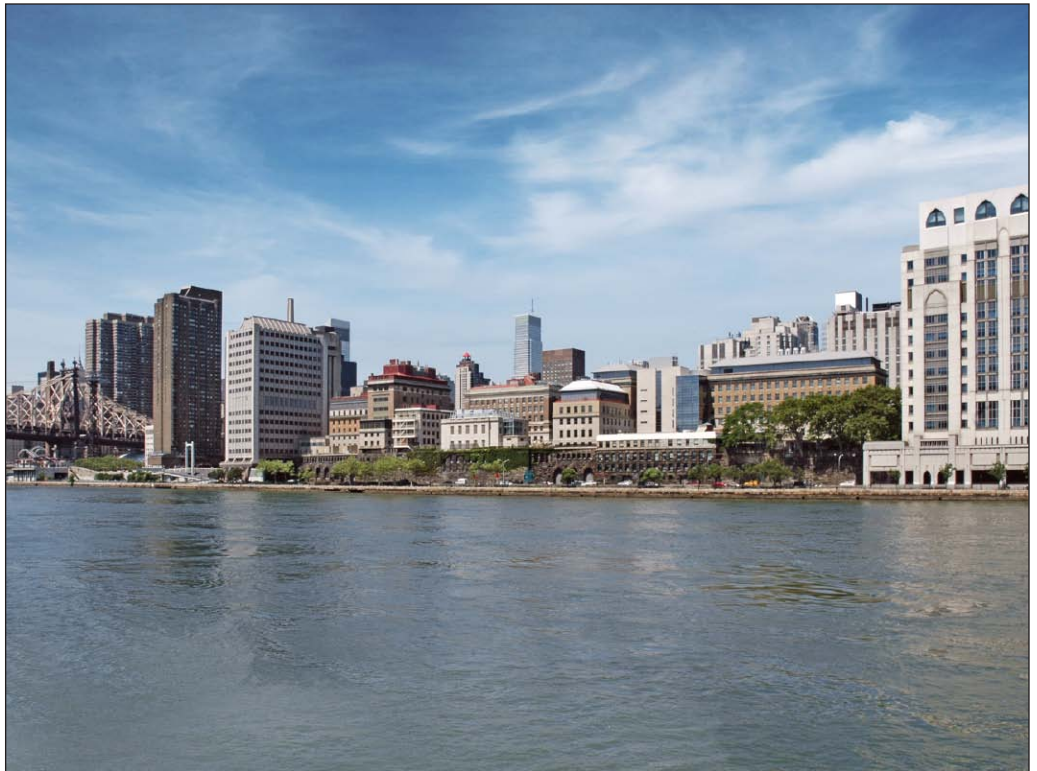
Existing/ No-Action Condition