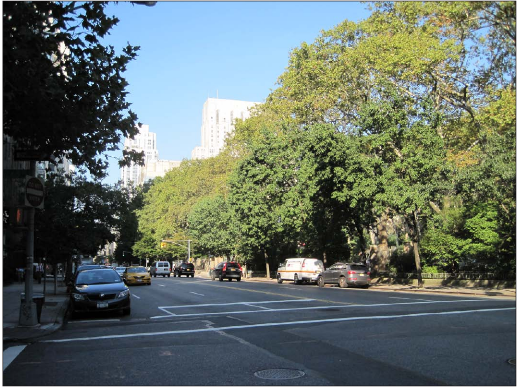
View north on York Avenue from East 65th Street 1