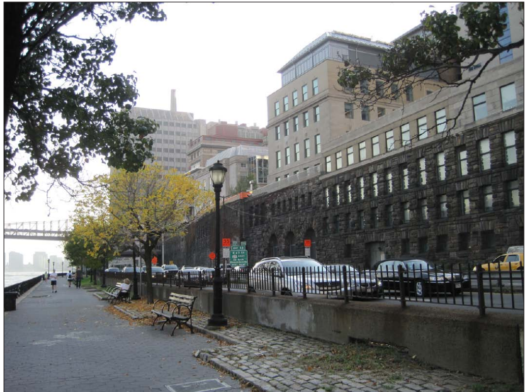
View south on East River Esplanade from around East 67th Street 5