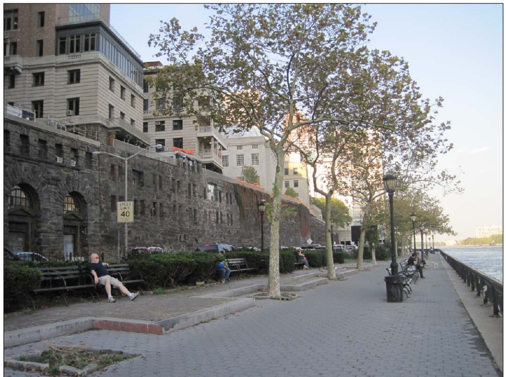
View north on East River Esplanade from around East 64th Street 4