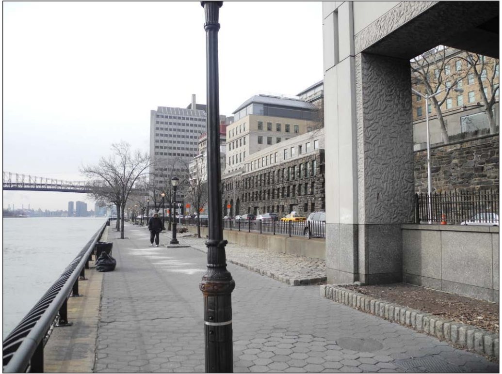
Existing/ No-Action Condition