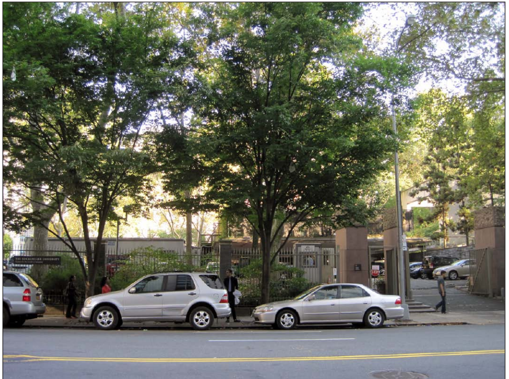
View east at York Avenue and East 68th Street 7