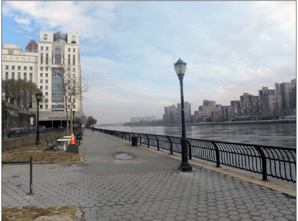
Existing/ No-Action Condition