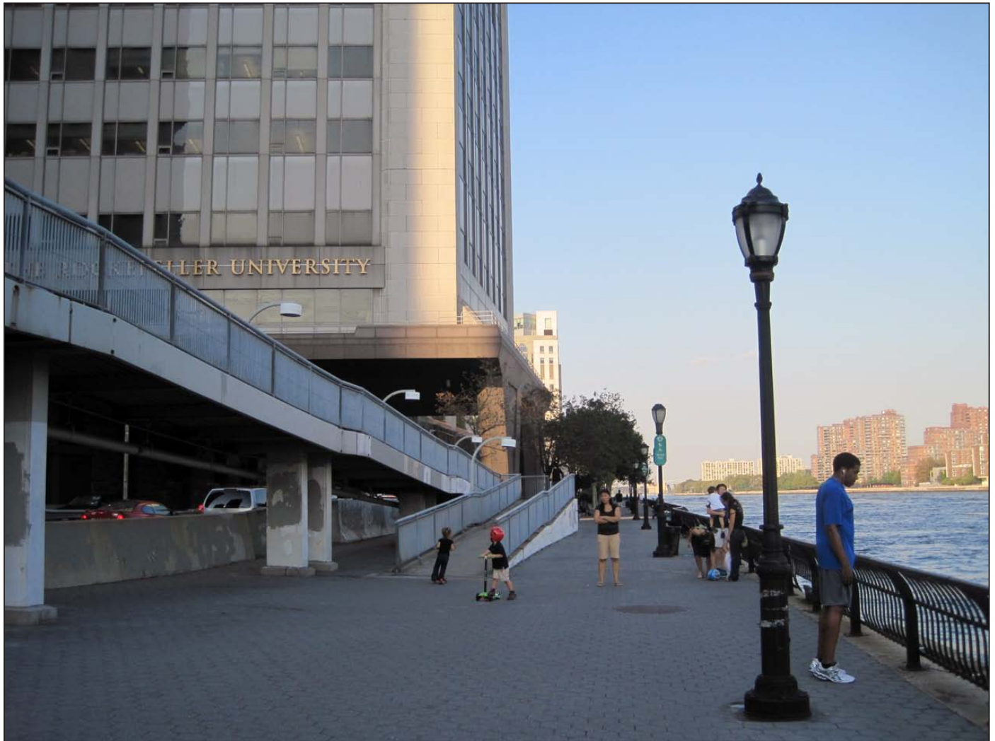
View north on East River Esplanade from around East 63rd Street 11