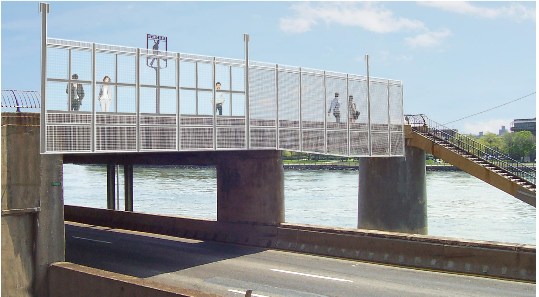
Current Window Concept