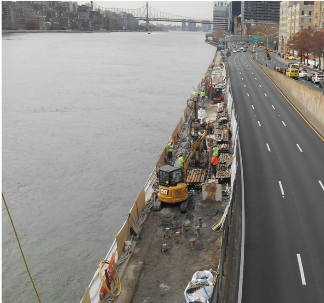
Current State of the Project