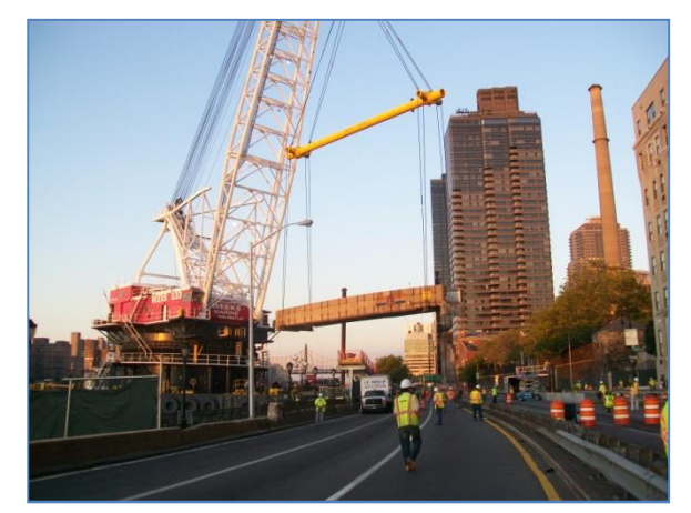
Old Bridge Span Removed on July 31

Uptown traffic on the Northbound Drive will be directed along 1<sup>st</sup> Avenue from E. 61<sup>st</sup> Street to E. 96<sup>th</sup> Street as shown on the attached page.