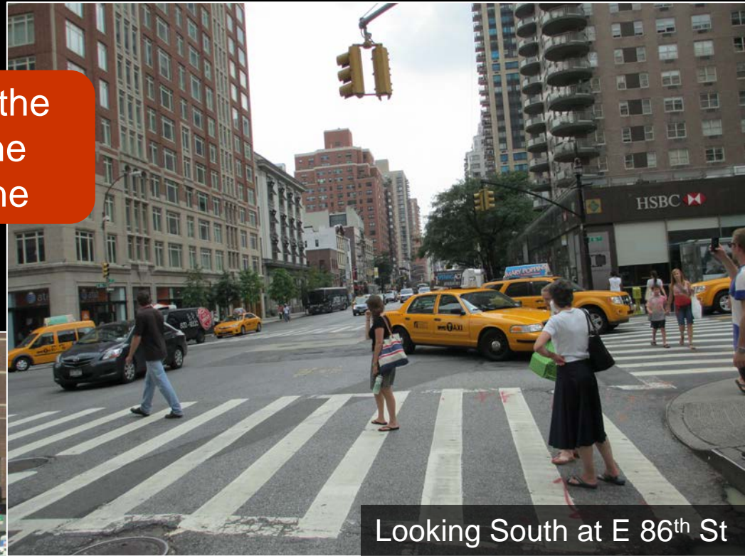
Looking South at E 86th St