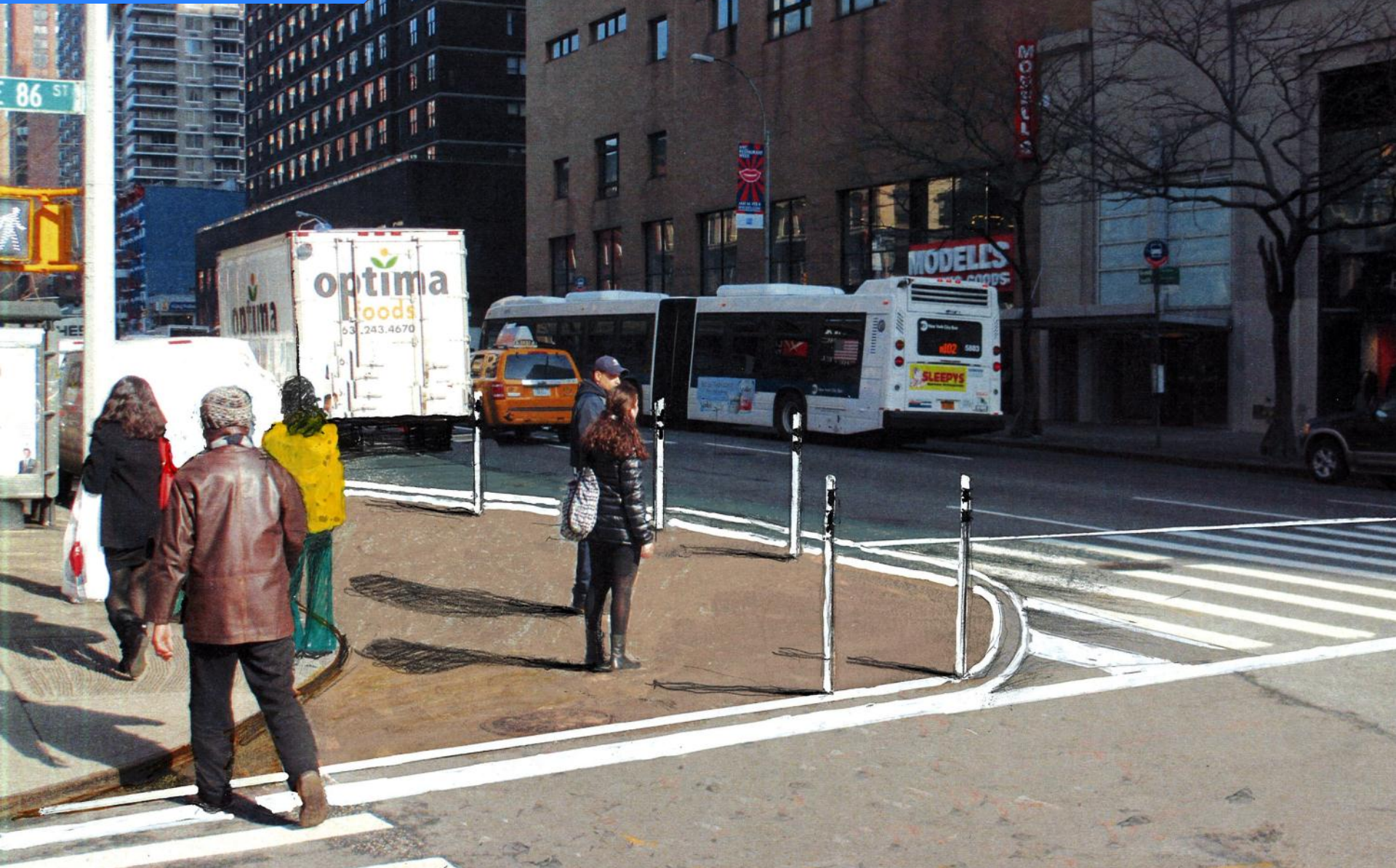
Looking North at E 86 th St