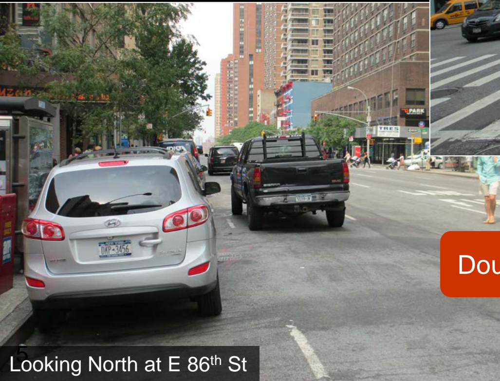
Looking North at E 86th St

Pedestrians waiting in the roadbed to cross in the shadow of parking lane