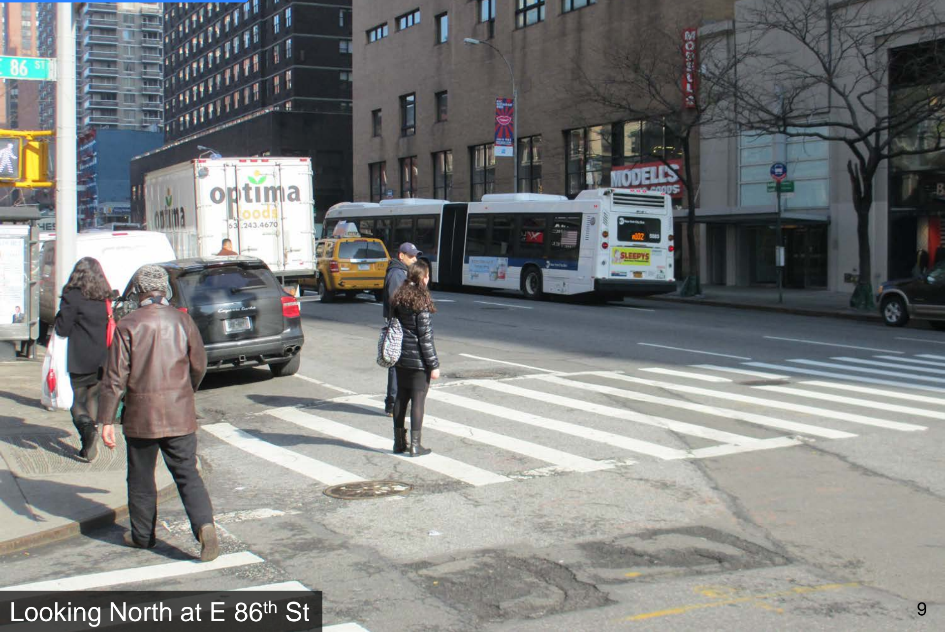
Looking North at E 86 th St